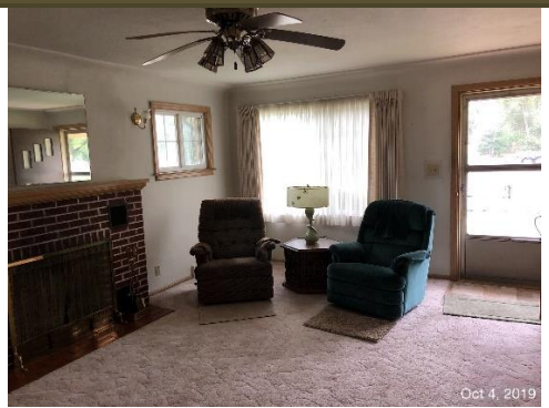
1949 Prairie Style Brick Home on a large lot with one-car detached garage and full basement.