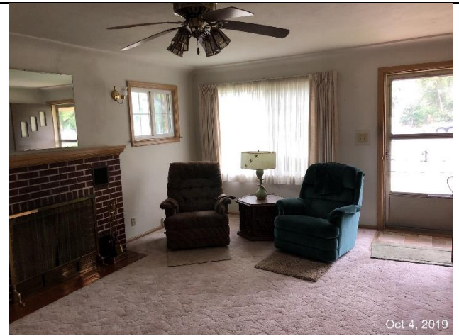
Living Room w/fireplace