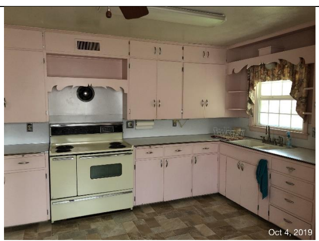
Kitchen including appliances